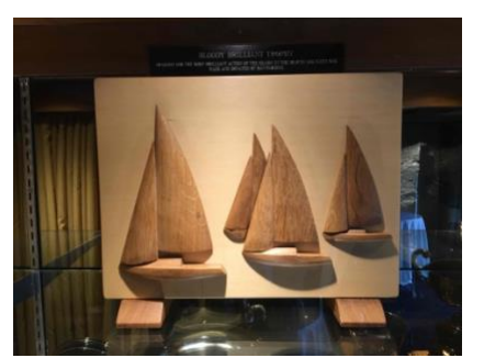
Bloody Brilliant Trophy