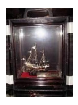
M242 Thursday Evening Series